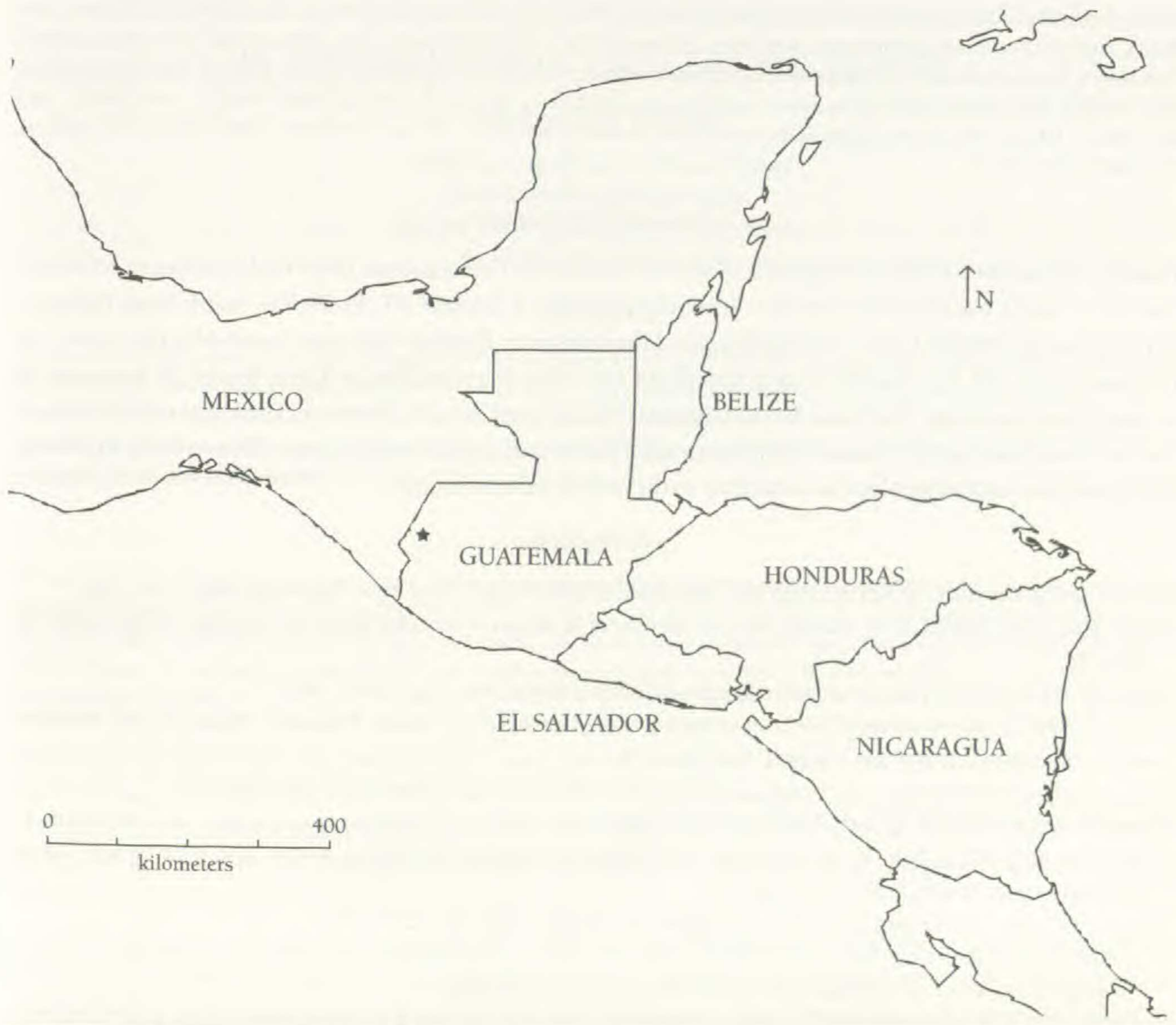
FIG. 2. Known distribution of Salvia carrilloi in Guatemala. Peña Blanca is located in the Sierra Chuchumatanes in the Department of Huehuetenango, Guatemala, near the Mexican border.

azureus , Chiranthodendron pentadactylon , Clethra pachecoana , Hedyosmum mexicanum , Ocotea salvinii , and Oreopanax echinops . Common herbs are represented by Alchemilla guatemalensis , Halenia decumbens , Potentilla heterosepala , Roldana acutangula , R. heterogama , Salvia cinnabarina , S. excelsa , and S. gracilis . The geological substrate in the area is characterized by limestones of the Cretaceous and Quaternary calcareous material (IGN 1970). The soil is clay and mosses are abundant.